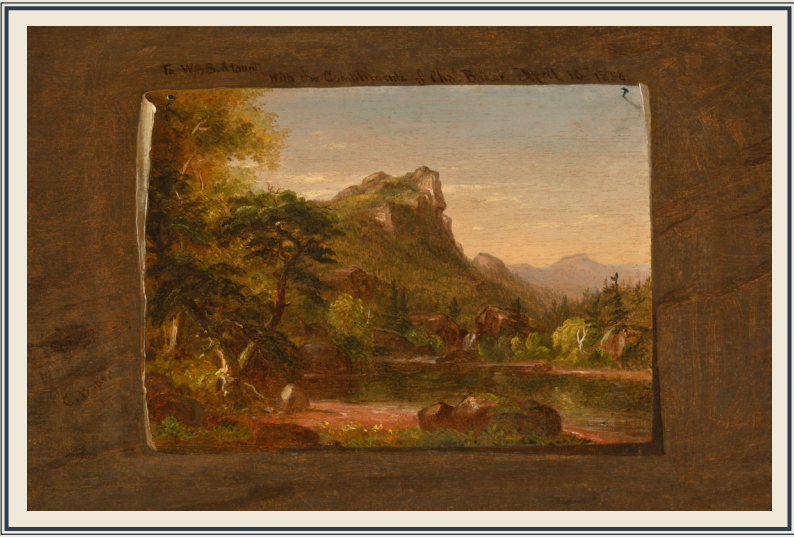
★ Trompe L'Oeil Landscape , Charles Baker, American, 1839 – 1888, oil on panel, Manoogian Collection