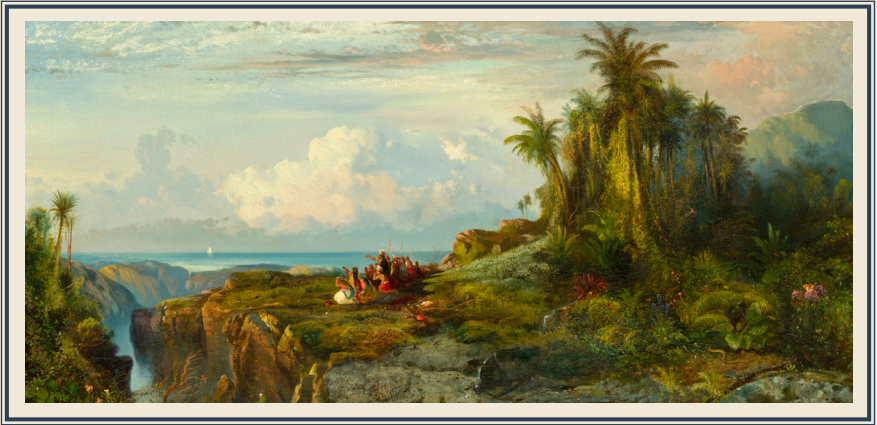
★ A New World , 1864, Thomas Moran, American, 1837-1926 oil on canvas Manoogian Collection