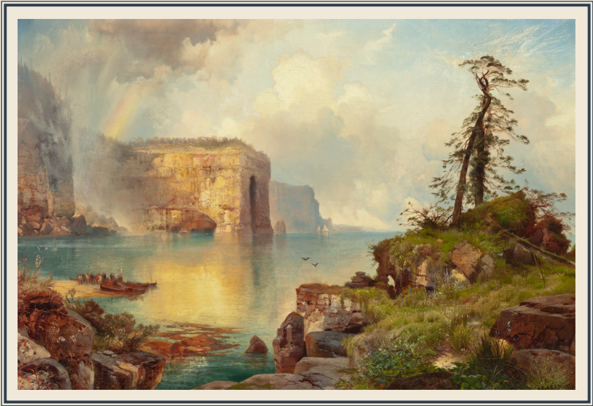
★ The Great Cave, Pictured Rocks, Lake Superior, Michigan, 1873, Thomas Moran, American, 1837-1926, oil on canvas, Manoogian Collection