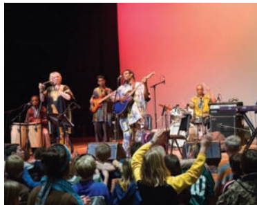
Images: Students dance along to the music of Adam Solomon of the African Guitar Summit

The 2010-2011 school year brings many new changes and challenges for teachers and museum staff alike. We are offering a variety of concerts and gallery experiences to supplement your teaching in the classroom.